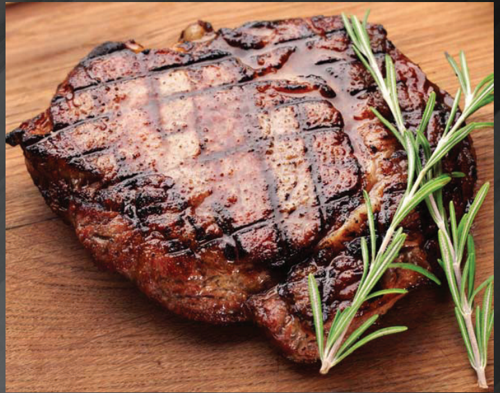
10 oz Ribeye