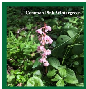
Common Pink Wintergreen