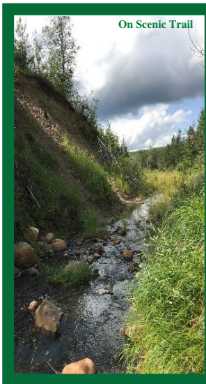
On Scenic Trail